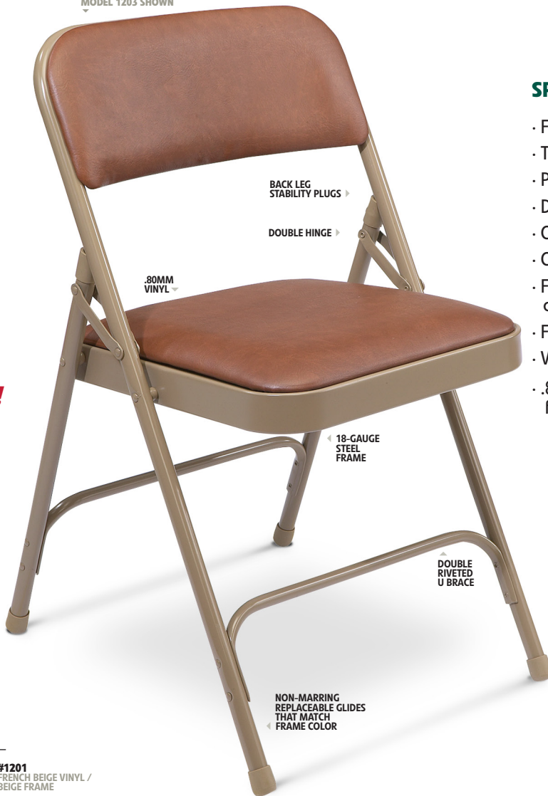
MODEL 1203 SHOWN