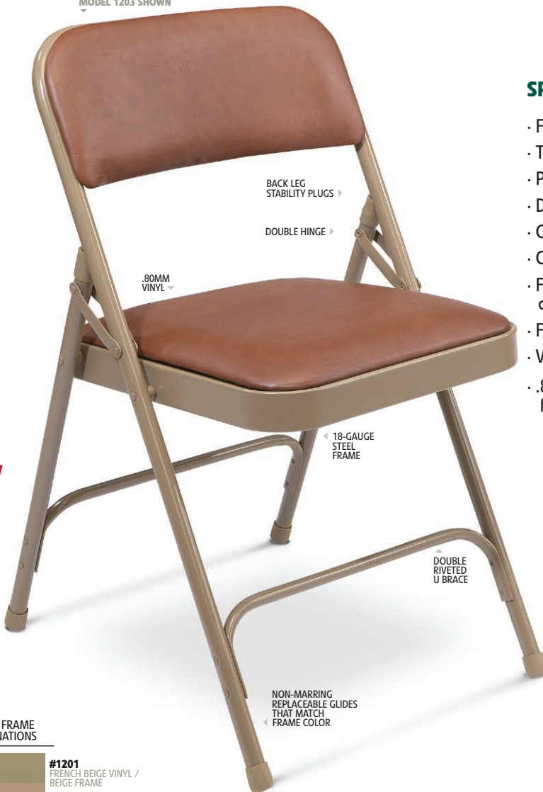
MODEL 1203 SHOWN