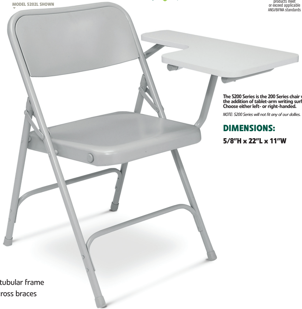
MODEL 5202L SHOWN

products meet or exceed applicable ANSI/BIFMA standards