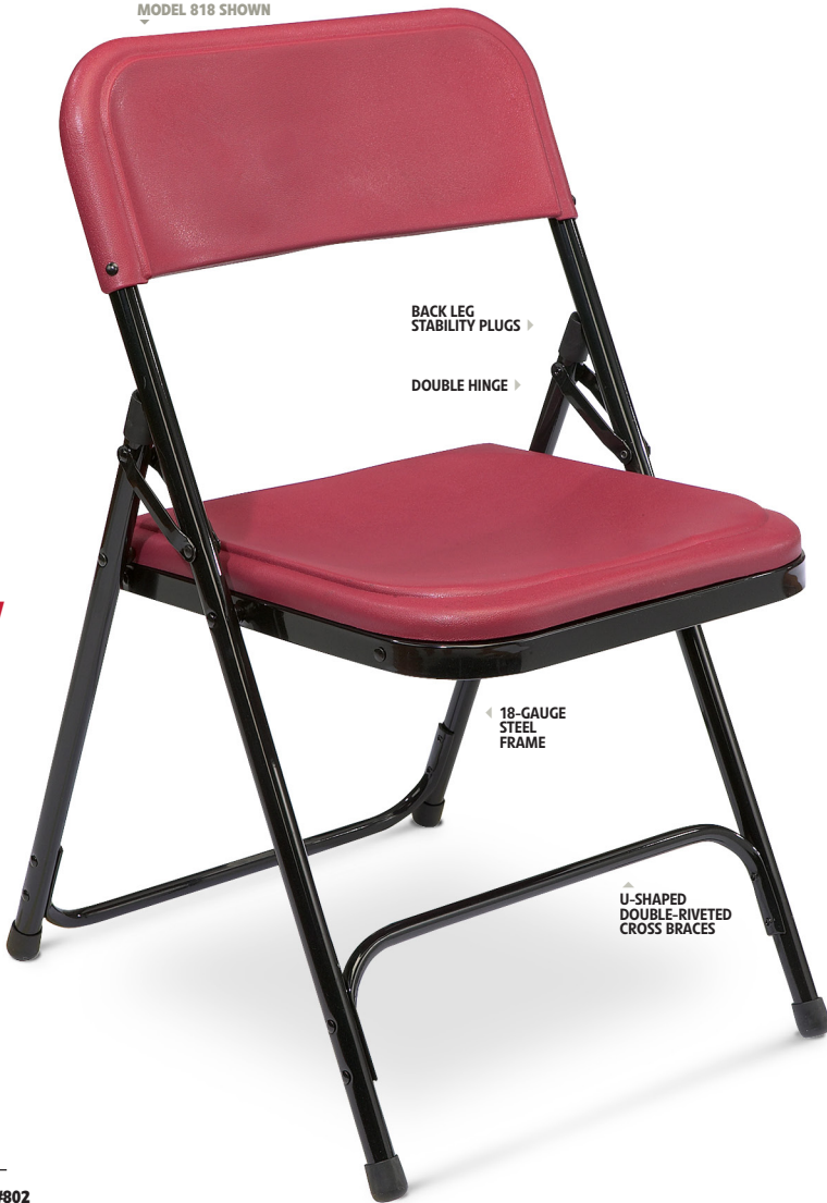
MODEL 818 SHOWN

products meet or exceed applicable ANSI/BIFMA standards