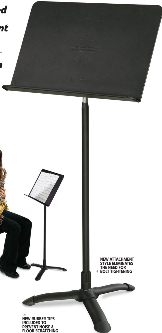
NEW ATTACHMENT STYLE ELIMINATES THE NEED FOR BOLT TIGHTENING