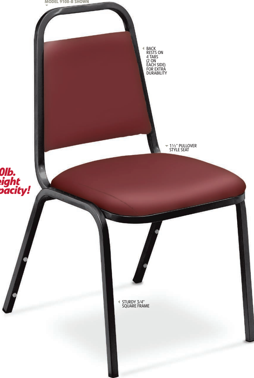
MODEL 9108-B SHOWN

BACK RESTS ON 4 TABS (2 ON EACH SIDE) FOR EXTRA DURABILITY